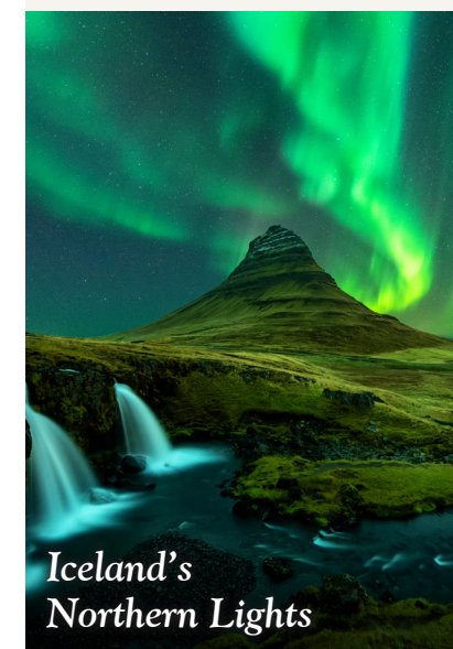
Iceland's Northern Lights

Transportation to other locations' trips will not be provided. If 20 or more people from one location want to travel to another location, then transportation will be considered.